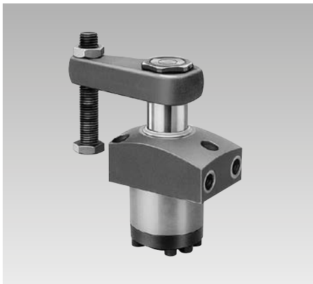
Example: Swing clamp Part no. 1895103