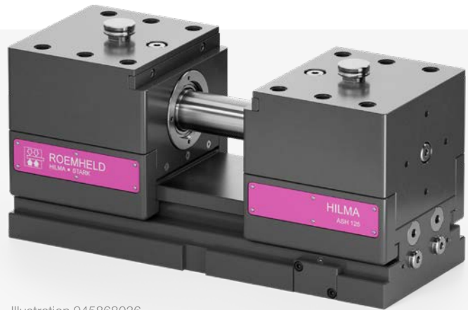
Illustration 945868036 Scope of delivery HILMA.ASH 125